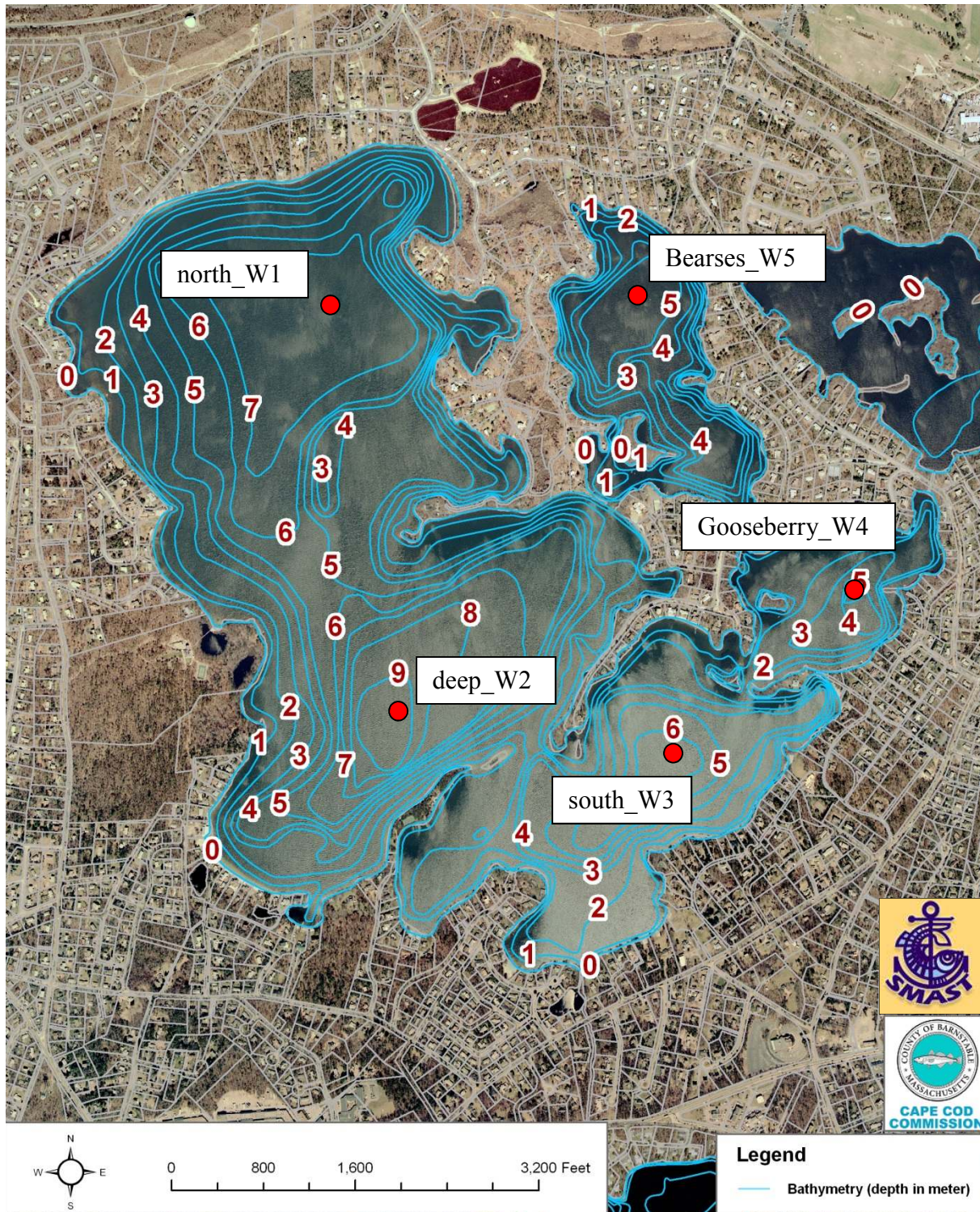
Figure 1. Lake Wequaquet Water Quality Sampling Stations Red circles indicate five in-pond locations where water quality samples have been historically collected. Figure is modified from Figure II-1 in Eichner (2009).